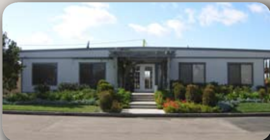
Custom 24' x 60'

Short term rentals Long term leases Lease to own Purchase