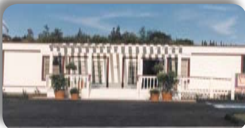
24' x 40' Sales Office

12580 Stotler Court Poway, California 92064 www.mbconcepts.com